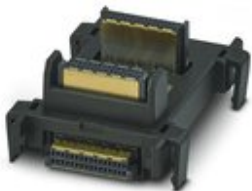
Bus base module for left-aligning the AXC F 2xxx controllers

Please be informed that the data shown in this PDF Document is generated from our Online Catalog. Please find the complete data in the user's documentation. Our General Terms of Use for Downloads are valid ( http://phoenixcontact.com/download )